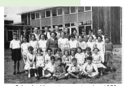
School with post war extension 1959