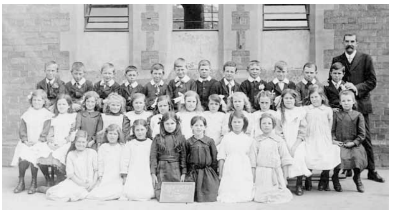
Bidford Junior School, 1914 PH352/30/93